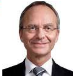
Minister of Economic Affairs of the Netherlands Henk Kamp