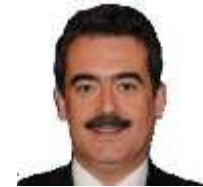
Minister of Energy of Romania Andrei Gerea