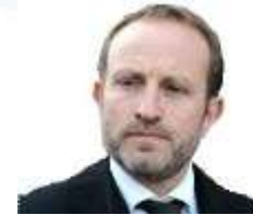
Minister of Foreign Affairs of Kingdom of Denmark Martin Lidegaard