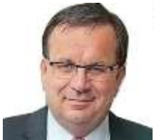
Minister of Industry and Trade of Czech Republic Jan Mladek