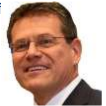
European Commissioner Maroš Šefčovič