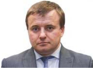
Minister of Energy and Coal Industry of Ukraine Volodymyr Demchyshyn