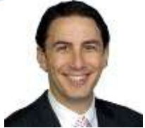
Special Envoy of the USA Amos Hochstein