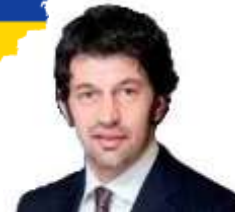
Deputy Prime Minister of Georgia Kakha Kaladze