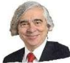
Minister of Energy of the USA Ernest Moniz